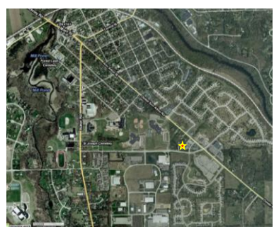
★ = DSL service unavailable